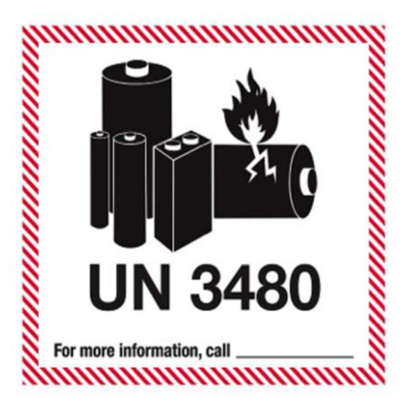
Figure 5. UN3480 label

4. Finally, UN3480 covers shipping lithium batteries shipped by themselves. To indicate this on the packaging, the label shown in figure 5 is also required. The shipper's phone number should be included on the label.