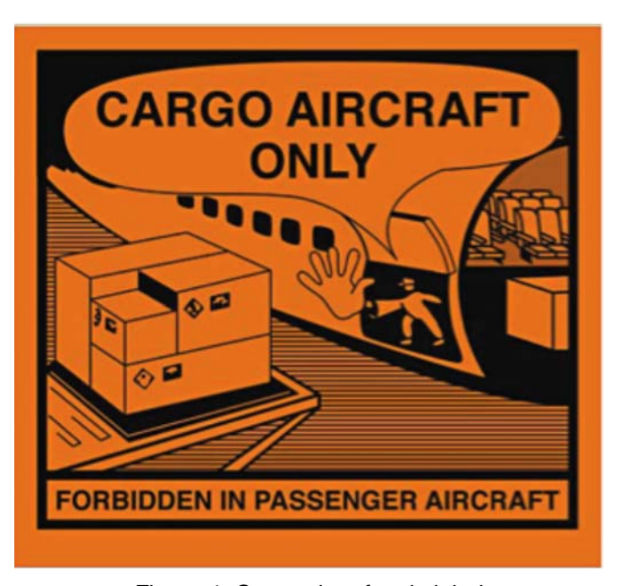
Figure 4. Cargo aircraft only label

3. The capacity of these batteries does not allow for shipping on passenger aircraft. The label shown in figure 4 must also be present on the shipping container when shipping via air. When shipping via ground, this label is not required.