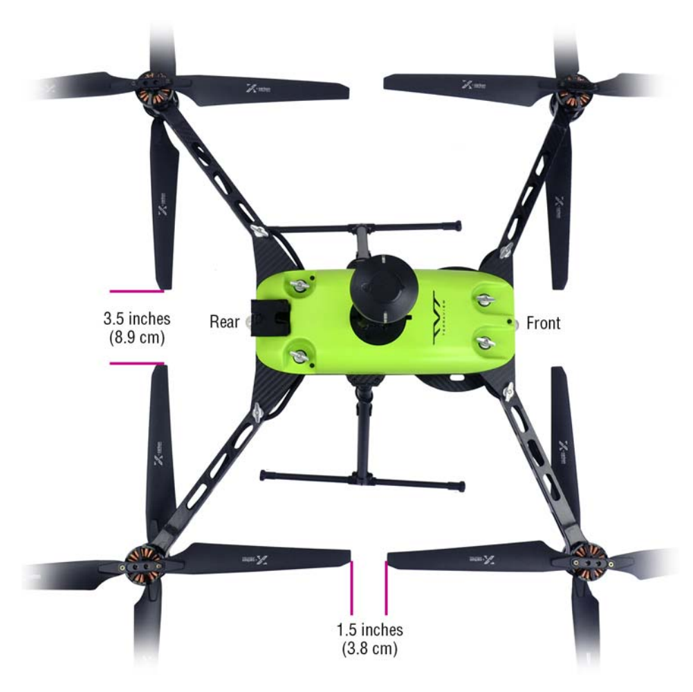
Figure 1. Proper distance between propeller tips